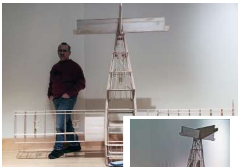
Sal Raia's 35% Scale RV-14