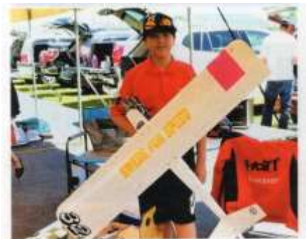
Plane reads: "Swede for Speed"